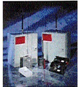
TWS Communications Products