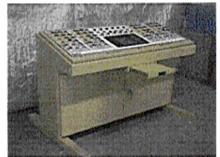
Billet Weigh Control Console Operator's Pulpit