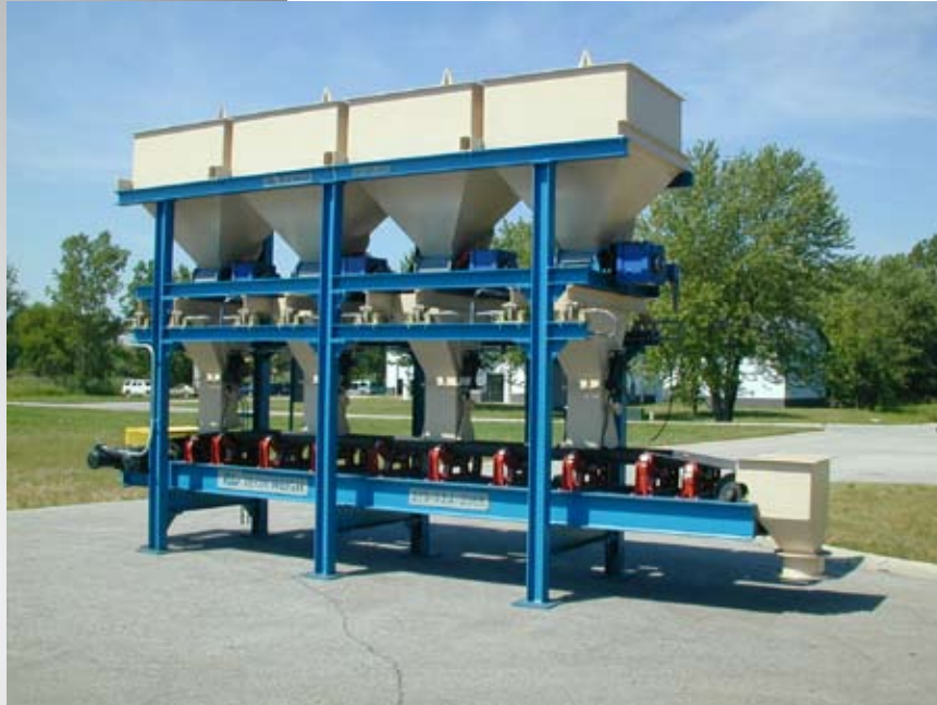
Four Hopper Alloy Additive System shown

In the competitive mill environment, accuracy is the key. Technical Weighing Services provides a fast and accurate way to add alloys to each heat. The system is built mill duty and proven in the industry.