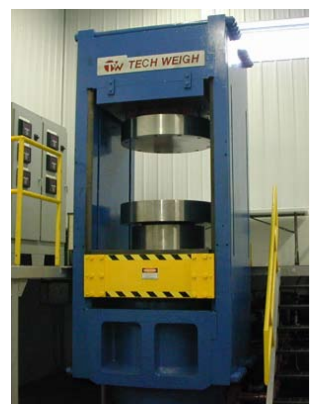
3 Million Pound Calibration/Test Press

The compression is the reduction in the height of the load cell when the load rises from 0 to nominal load. Accuracy class is defined as the maximum deviation and is expressed as a percentage or the sensitivity at nominal load. This includes linearity deviation, hysteresis and repeatability error.