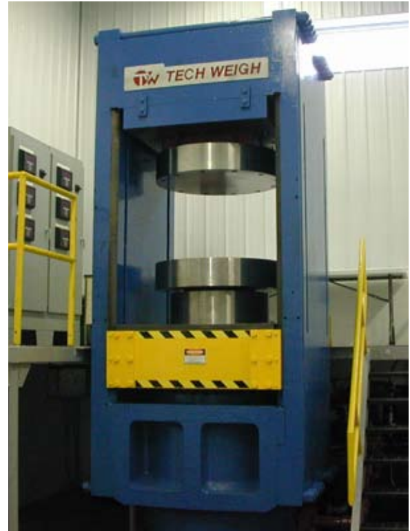
3 Million Pound Calibration/Test Press

The compression is the reduction in the height of the load cell when the load rises from 0 to nominal load. Accuracy class is defined as the maximum deviation and is expressed as a percentage or the sensitivity at nominal load. This includes linearity deviation, hysteresis and repeatability error.